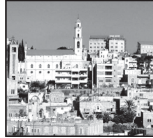
The City of Bethlehem located in Palestine is believed to be the birthplace of Jesus

(Verse 37) So her Lord accepted her with good acceptance and caused her to grow in a good manner and put her in the care of Zechariah [because her father had passed away]. Every time Zechariah entered upon her in the prayer chamber [which he prepared for her in the masjid], he found with her provision [i.e. fruits out of their season]. He said, "O Mary, from where is this [coming] to you?" She said, "It is from Allah. Indeed, Allah provides for whom He wills without account